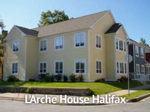
L'Arche House Halifax