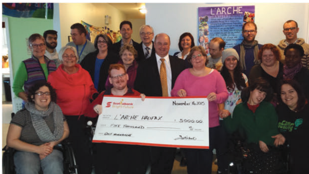
PRESENTATION OF CHEQUE BY SCOTIABANK

Save the date for our 8 th Annual Golf Tournament—SEPTEMBER 1, 2016